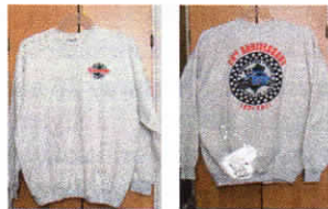
Front, Back H- 732-223-9388 Cell -732-492-5656