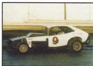
Clark Sutton at New Egypt Speedway Legends of the Fall October 1999