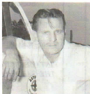
1964 J. Fitzpatrick Photo