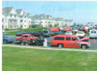
Chris Felber's Custom Chevy Suburban and vintage race car.