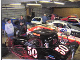
During a heavy rain storm all of the GSVSCC cars were crammed in one of the garages.