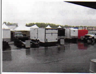
Rainy day at Loudon on Wednesday.