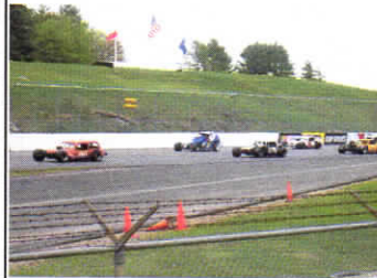
Some of the Modifieds in the back stretch.