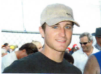
Ray Evernham "Racin for a Reason" Kasey Kahne & Elliott Saddler