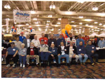
Motorsports 2007 - Atlantic City Speedway reunion.