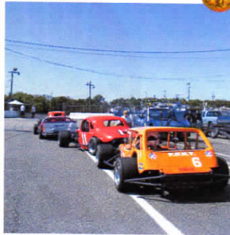
Sunday Track time.