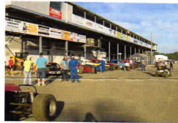
Bridgport Speedway 2007