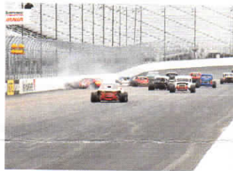
Loudon, New Hampshire, May 2007