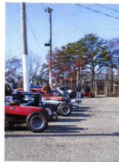
Turkey Derby 34 at Wall Speedway with 15 cars on display and 12 going on track.