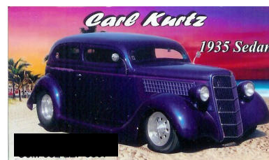
2011-My All-Steel Small Block '35 Ford 5" Chop Pro-Street (A Survivor Body)