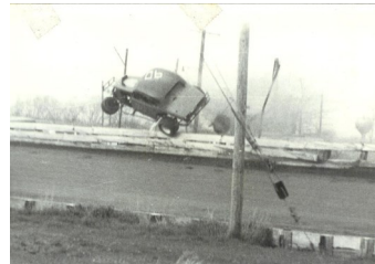
1974 Flemington Side Trip (Steering Broke)