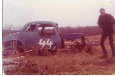
1972 -Paid $50!

Here are some photos of cars I built and drove.