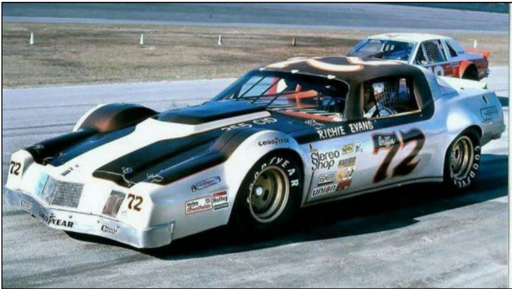
Richie Evans? Photo date: January, 1979