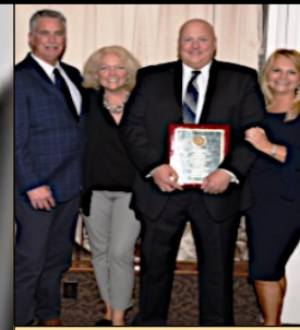
The Gleason's and Ling's share a proud moment